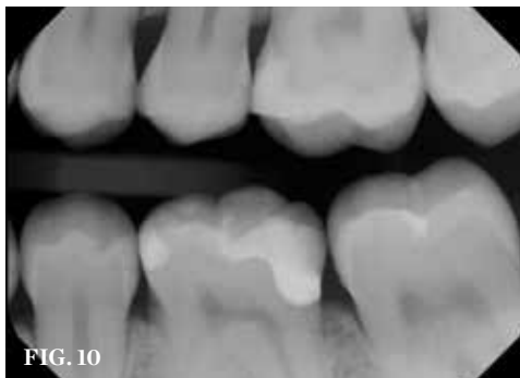
(7.) Completed margin elevation with perfect marginal seal. Mesial caries treated separately at cementation appointment. For an indirect restoration, the final impression will be taken now. (8.) Cementation appointment. Tooth is conditioned by air abrasion and phosphoric acid etching for maximum bond strength. An indirect or a chairside fabricated inlay restoration provides maximum stress reduction and maximum bond strength. (9.) Cementation of inlay, access of mesial caries. Mesial lesion is restored separately to conserve valuable intact tooth structure. (10.) Final radiograph.