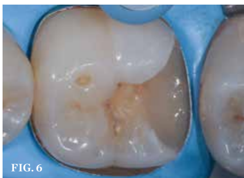
(1.) Initial radiograph. Deep distal caries extending near crest of bone. (2.) Initial access and hemostasis with viscostat clear. (3.) Caries removal endpoint and peripheral seal zone development. (4.) Matrix band placed for deep margin elevation (Garrison Margin Elevation Band). (5.) Immediate dentin sealing. (6.) Margin Elevation and resin coating completed. This is the "Bio-base."

2. Decouple with time. This protocol states that polymerization shrinkage stress to the developing dentin bond of the hybrid layer should be minimized for a certain period of time (ie 5 to 30 minutes) by keeping initial increments to a minimum thickness (ie less than 2mm). This minimal thickness prevents the connection, or "coupling," of deep dentin to enamel or superficial dentin before the hybrid layer is matured and close to full strength. This procedure neutralizes the "Hierarchy of Bondability," which states that the shrinkage of composite moves toward (or "flows" toward) the walls of the preparation that are the most mineralized and dry and flows away from the walls of the preparation that are the most moist and organic. 20,31-33