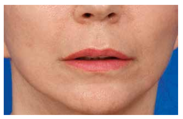
Fig 1 A 50-year-old patient presents wanting to show more tooth display at rest, reduce the length of her upper lip, and show more pink lip.