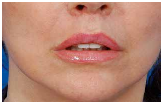
Fig 2 The 50-year-old patient 6 months after the external lip lift showing ideal tooth display at rest and a youthful inverted upper lip with increased visible vermillion.