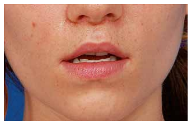
Fig 3 A 25-year-old patient with a senile upper lip pre-op ( left ) and 1 week post-op ( right ). Notice the hidden incision line directly under the nose, which can sometimes be a problem for certain patients.